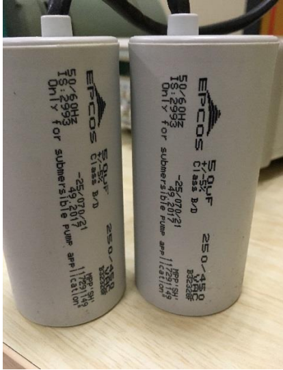
100 \mu F (2X50 \mu F connected in parallel)